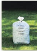
1 st day